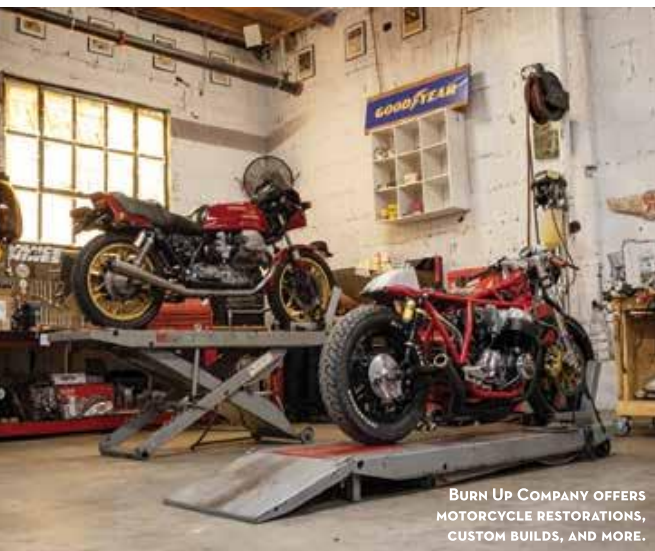
BURN UP COMPANY OFFERS MOTORCYCLE RESTORATIONS, CUSTOM BUILDS, AND MORE.